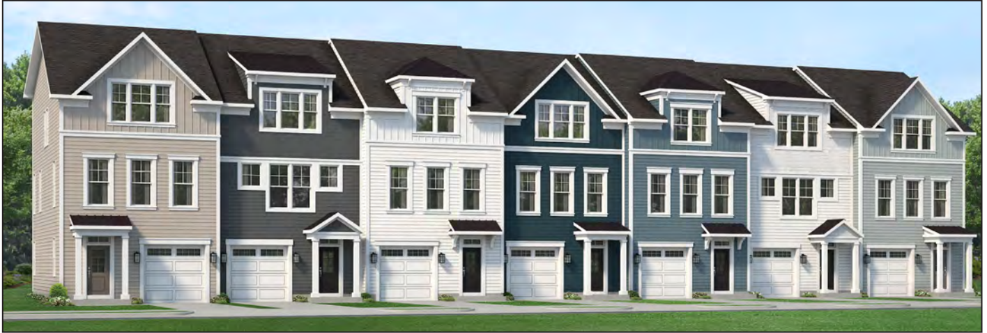
PICTURED: ELEVATION F, K, A, F, A, K, F WITH OPTIONS

The Savannah townhome will be 2,100+ SF, 3 bedrooms, three full baths, and single car garage. Walk Out basement w/Deck + Patio. All electric, no natural gas and no propane option.