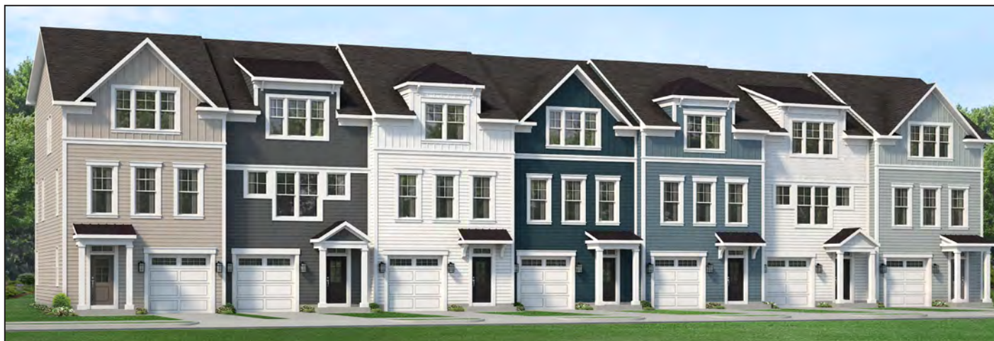
PICTURED: ELEVATION F, K, A, F, A, K, F WITH OPTIONS

The Savannah townhome will be 2,100+ SF, 3 bedrooms, three full baths, and single car garage. Walk Out basement w/Deck + Patio. All electric, no natural gas and no propane option.