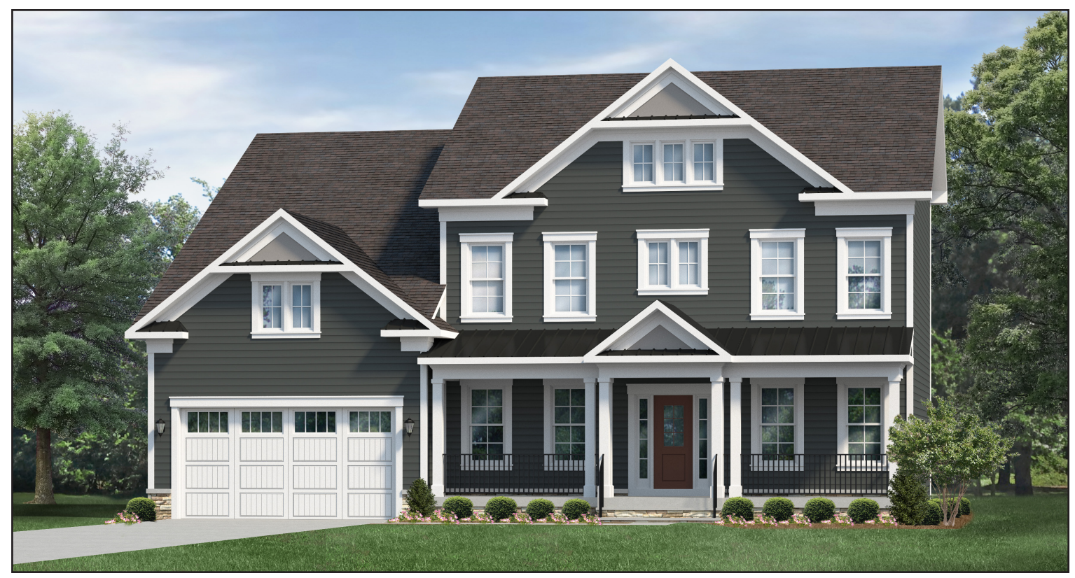
PICTURED: ELEVATION F WITH OPTIONS

7613 WOODRIDGE CIRCLE, ALEXANDRIA, VA 22308