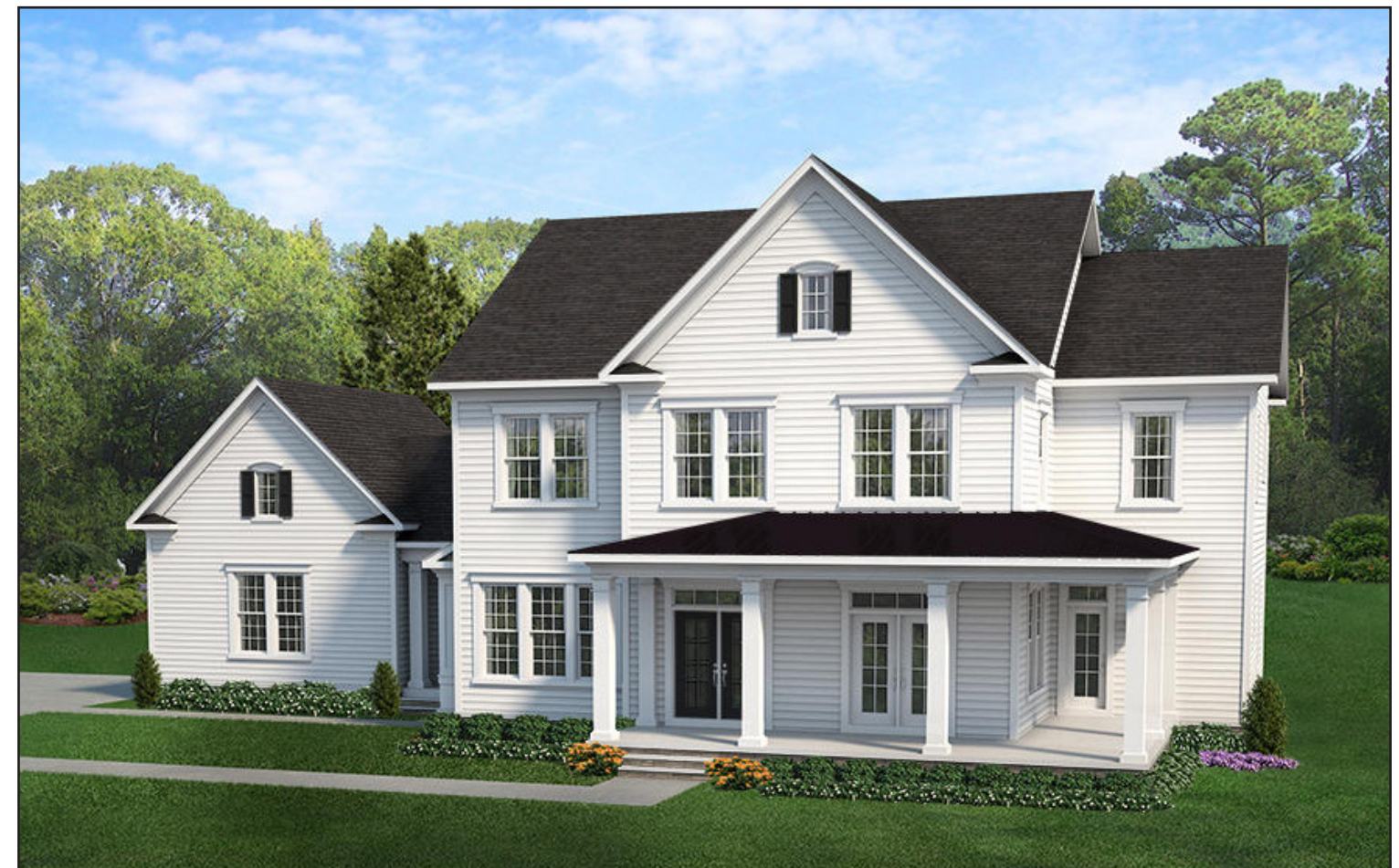
PICTURED: ELEVATION B WITH OPTIONS

15901 BERLIN TURNPIKE, PURCELLVILLE, VA 20132