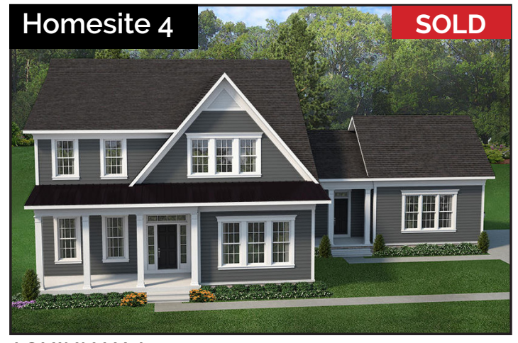
AQUINNAH A THIS HOME WILL HAVE A 3 CAR SIDELOAD GARAGE

*Note: Home price with lot specific options. Please contact us for more information.*