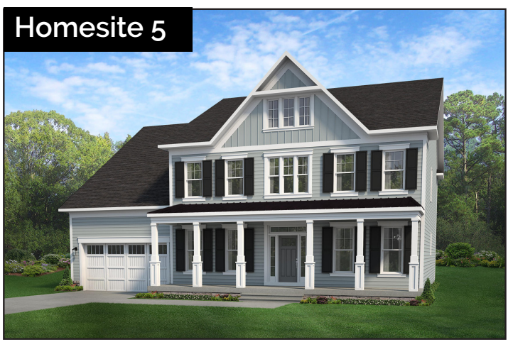
CHAPMAN L THIS HOME WILL HAVE A 3 CAR SIDELOAD GARAGE