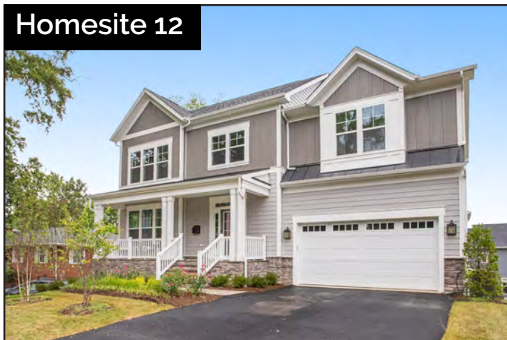
CAMDYN H - $1,734,500* 5 BD, 4.5 BA, 5,786 SF