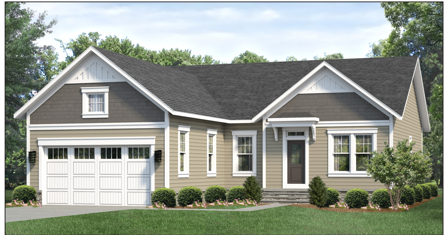
PICTURED: ELEVATION K WITH OPTIONS

APPROXIMATELY 1,767 SF STANDARD WITH 3 BD, 2 BA