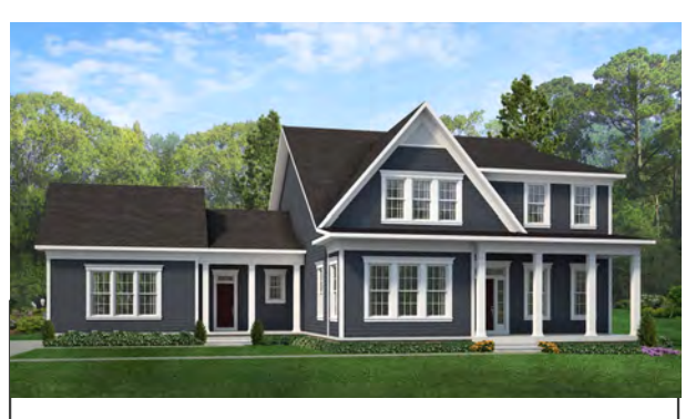
AQUINNAH 3,759-5,716 SF - $1,119,900