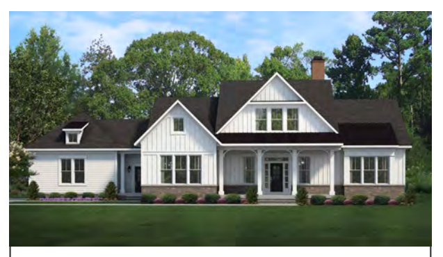
ROBEY 4,013-6,271 SF - $1,194,900