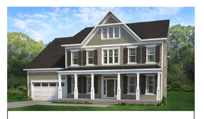
CHAPMAN 4,629-7,394 SF - $1,227,600