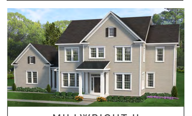
MILLWRIGHT II 4,248-6,179 SF - $1,164,900