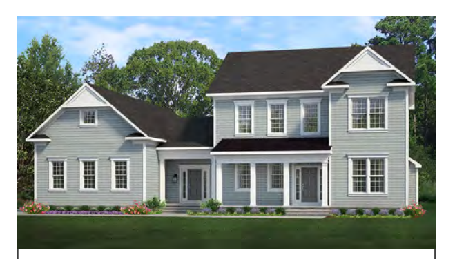
HILLSBORO 3,691-6,437 SF - $1,129,900