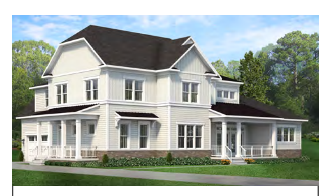
GREENWOOD 3,497-5,235 SF - $1,139,900

* Prices shown below are representative of elevation A only. *