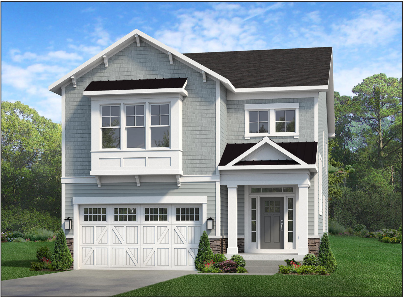
PICTURED: ELEVATION K WITH OPTIONS

APPROXIMATELY 2,735 SF STANDARD WITH 4 BD, 3.5 BA