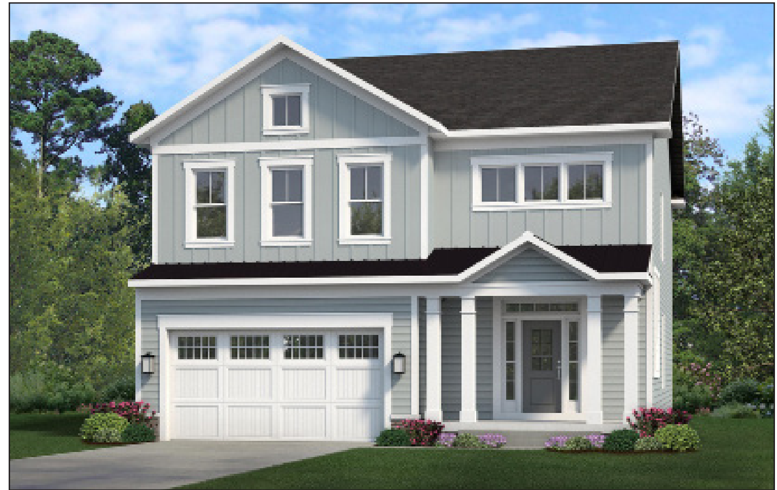
PICTURED: ELEVATION G WITH OPTIONS

APPROXIMATELY 2,979 SF STANDARD WITH 4 BD, 3.5 BA