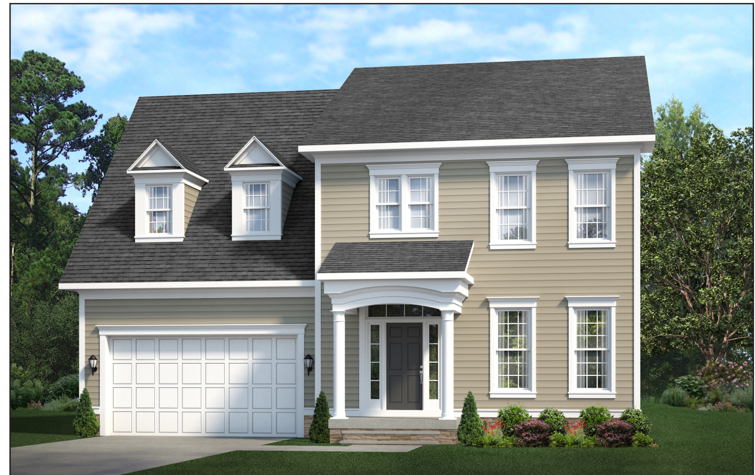
ELEVATION A WITH OPTIONS

6034 ARMSTRONG COURT, ALEXANDRIA, VA 22315