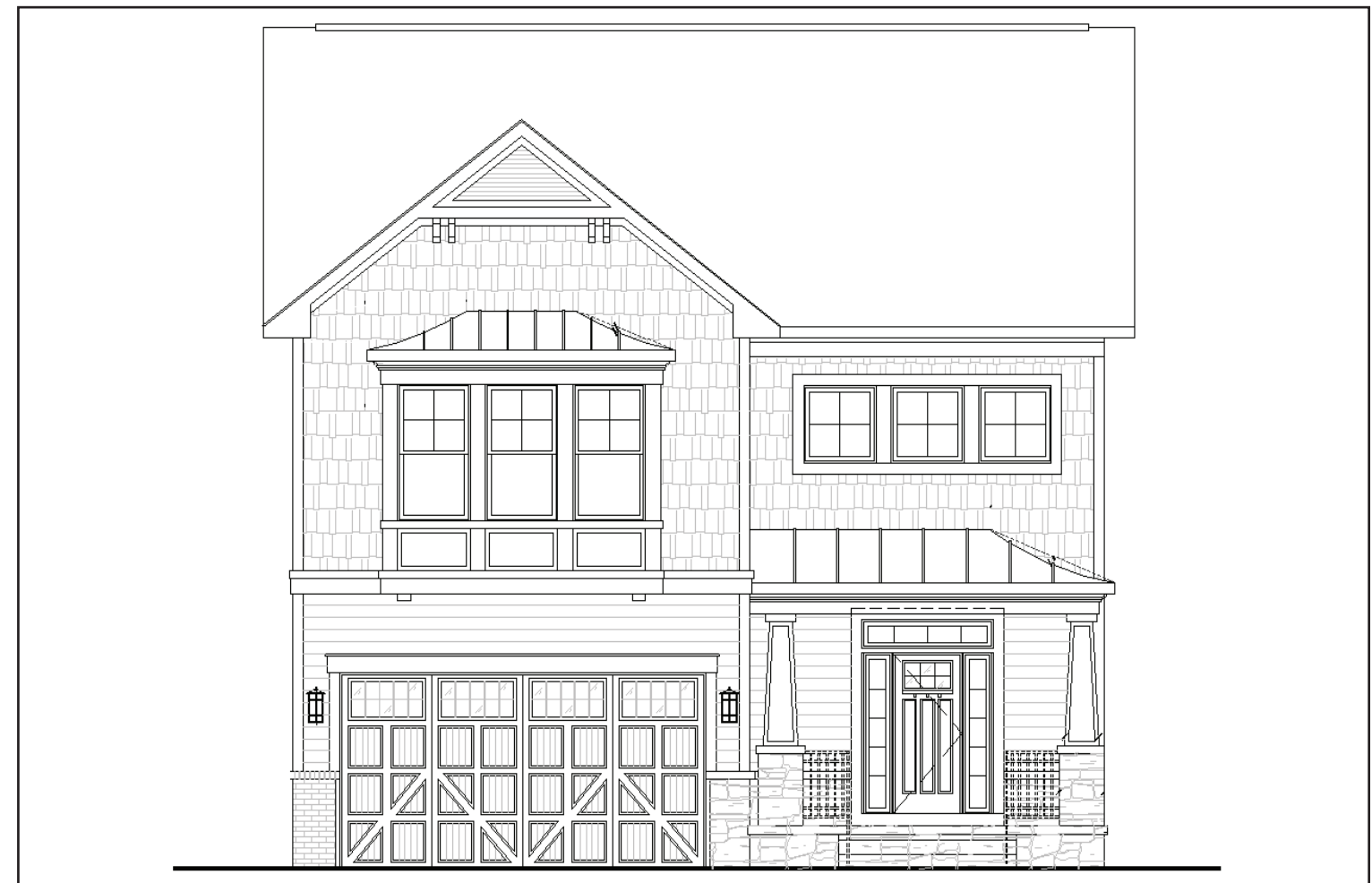
PICTURED: ELEVATION L WITH OPTIONS

8034 WASHINGTON ROAD, ALEXANDRIA, VA 22308 HOMESITE 0091