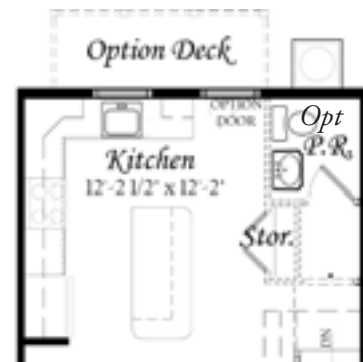
MAIN LEVEL W/ OPT REAR KITCHEN