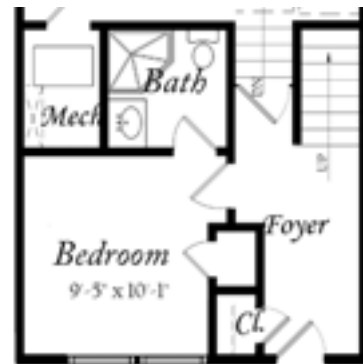
GROUND LEVEL W/ OPT BEDROOM