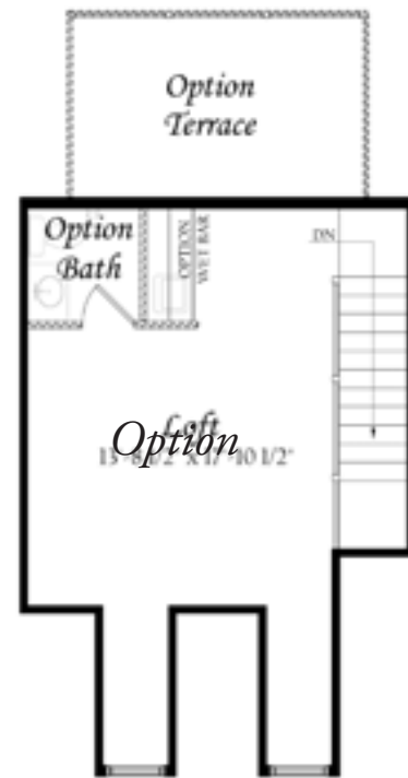
OPTIONAL LOFT LEVEL