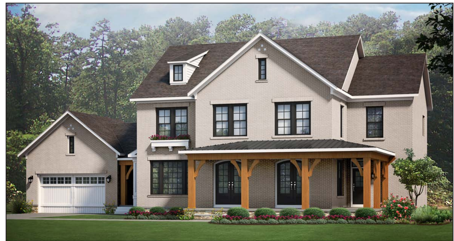
PICTURED: ELEVATION R2 WITH OPTIONS

CERTAIN PLAN AVAILABILITY MAY BE LIMITED TO SPECIFIC GEOGRAPHIC AREAS.