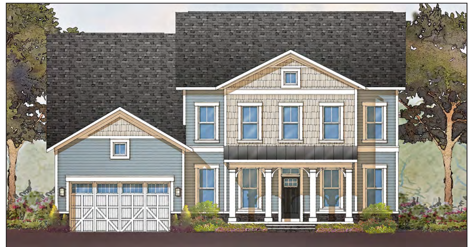
PICTURED: ELEVATION K WITH OPTIONS

APPROXIMATELY 3,679 SF STANDARD WITH 4 BD, 3.5 BA