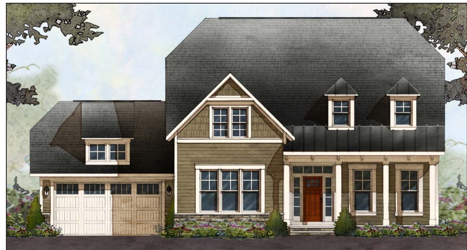
PICTURED: ELEVATION K WITH OPTIONS

APPROXIMATELY 3,391 SF STANDARD WITH 3 BD, 3.5 BA