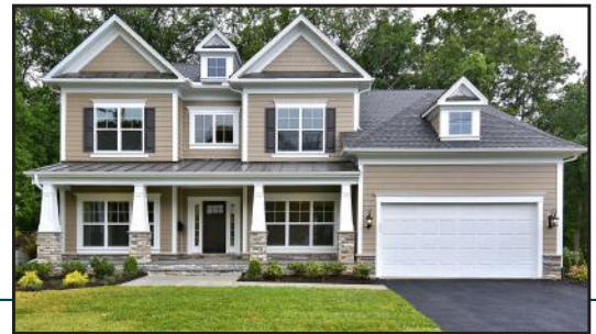
BARRETT 3,611 SF - $1,194,900* HOMESITES: 1, 2, 3