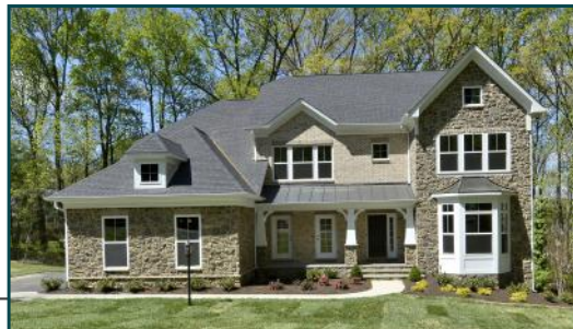
OXFORD 4,316 SF - $1,274,900* HOMESITES: 1, 3