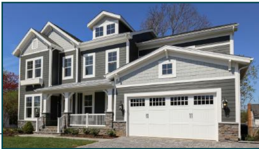
MADISON 3,543 SF - $1,174,900* HOMESITES: 1, 2, 3

* Plans and prices shown below are representative of elevation A only. *