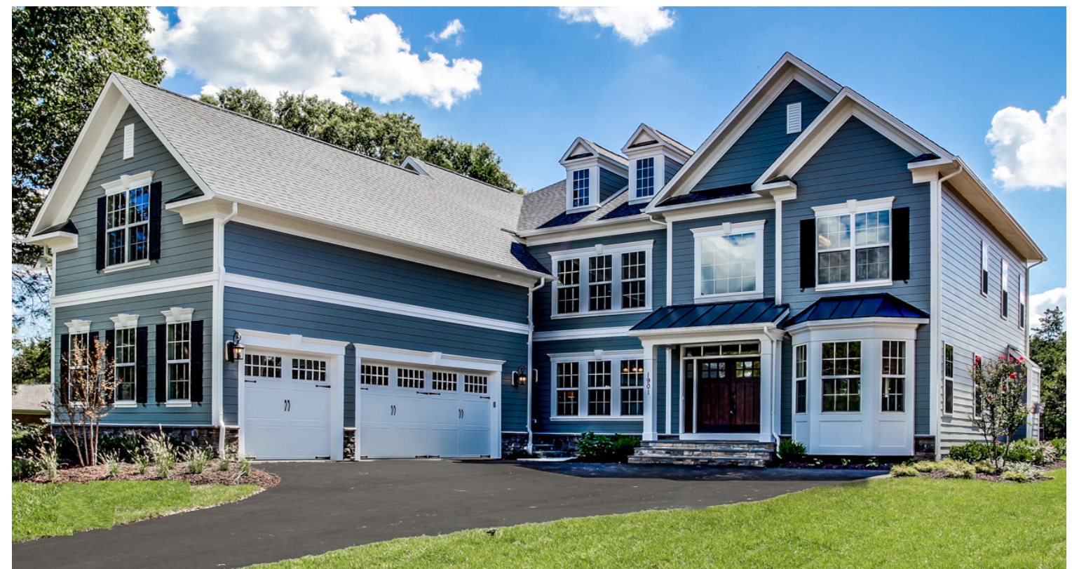
PICTURED: ELEVATION A WITH OPTIONS

10718 SPRUCE STREET, FAIRFAX, VIRGINIA 22030