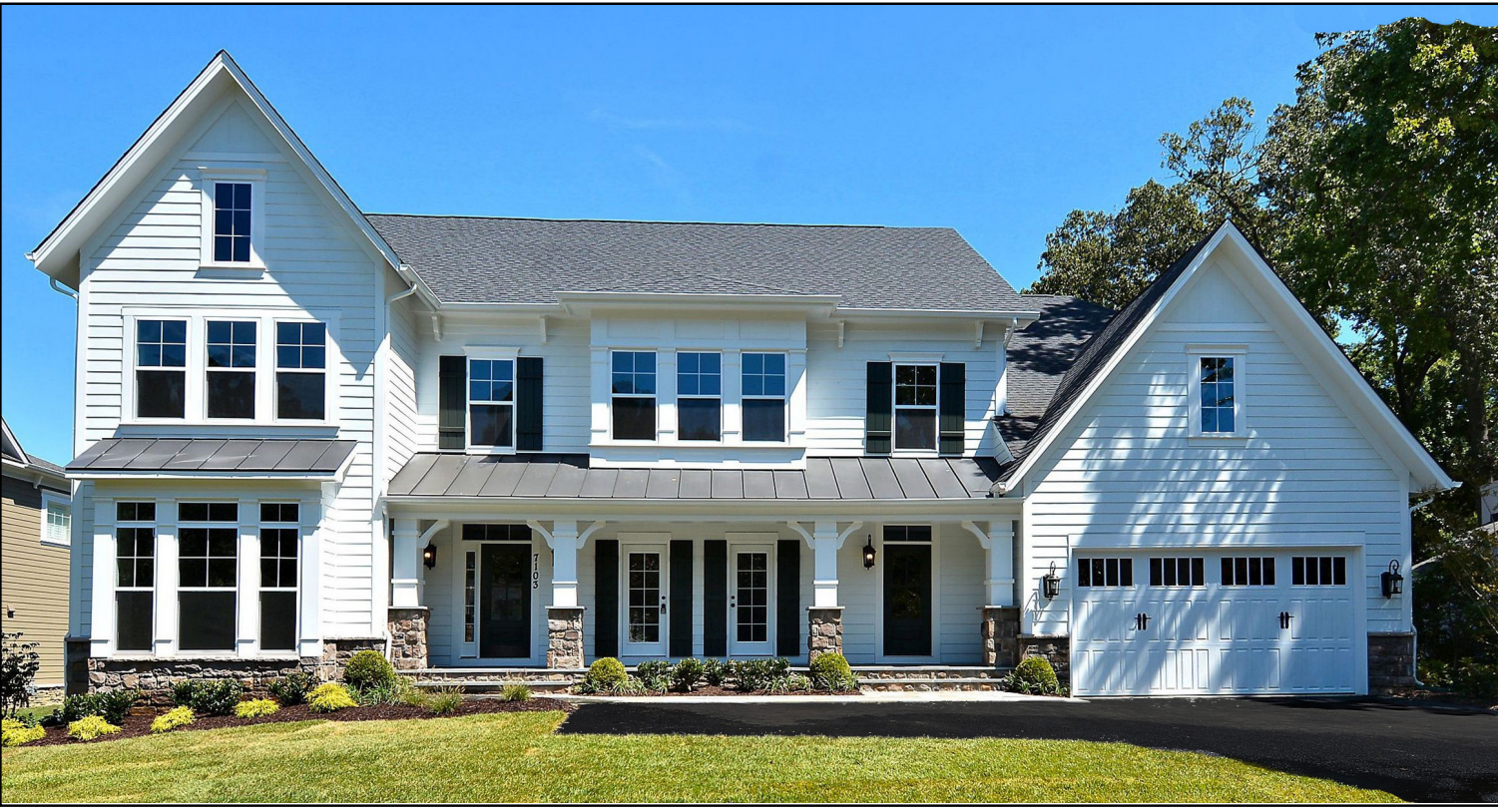
PICTURED: ELEVATION L WITH OPTIONS

APPROXIMATELY 4,714 SF STANDARD WITH 4 BD, 3.5 BA