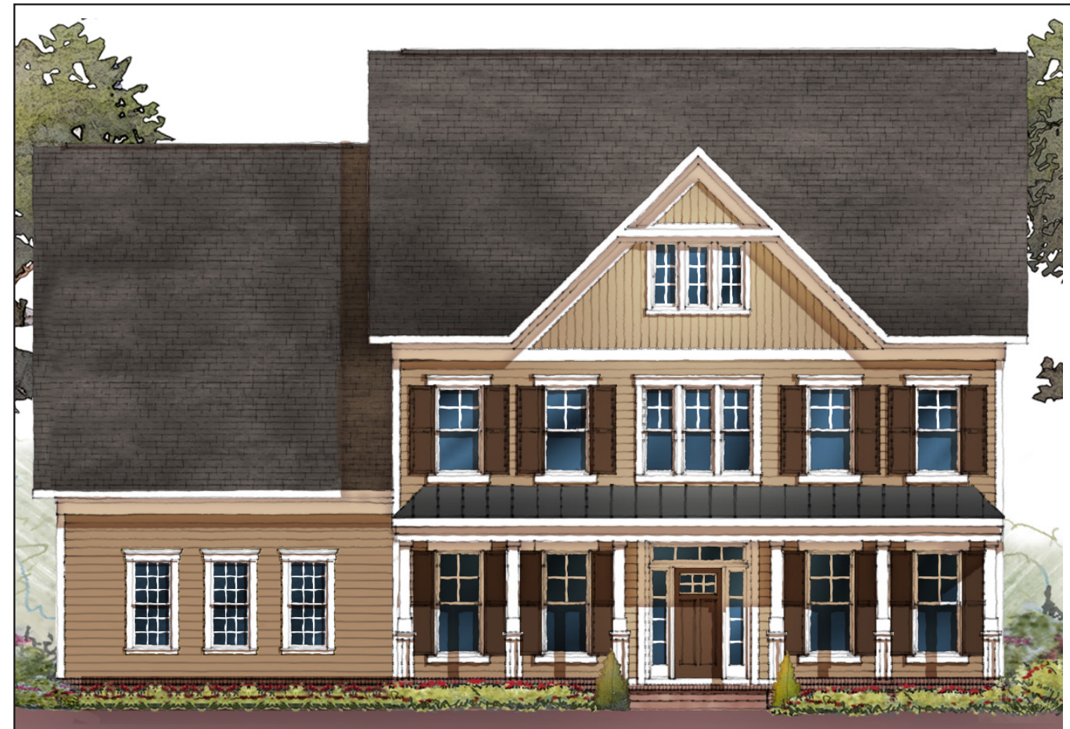
PICTURED: ELEVATION L1 WITH OPTIONS

APPROXIMATELY 4,664 SF STANDARD WITH 4 BD, 3.5 BA