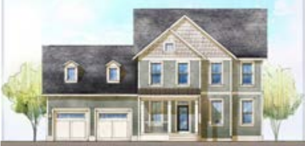
ELEVATION A (shown on cover)