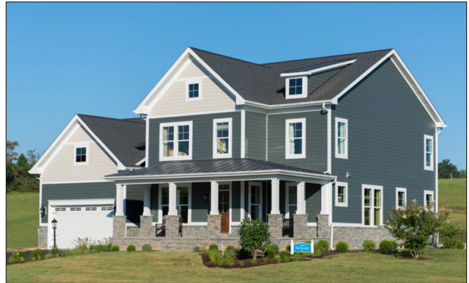
PICTURED: ELEVATION M WITH OPTIONS

APPROXIMATELY 3,370 SF STANDARD WITH 4 BD, 3.5 BA