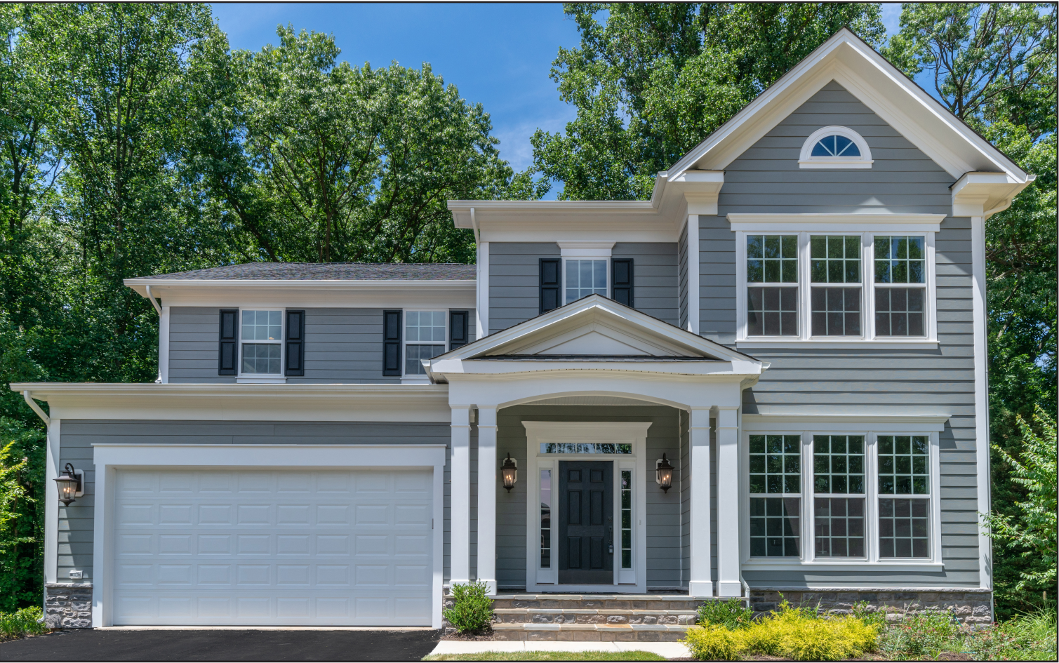
PICTURED: ELEVATION A WITH OPTIONS

2709 CHAIN BRIDGE ROAD, VIENNA, VA 22181