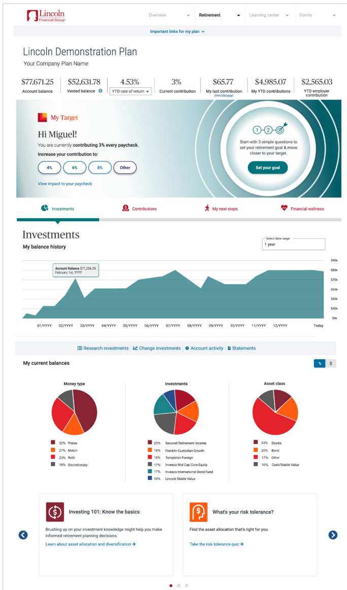
For illustration purposes only. Actual screens subject to change.