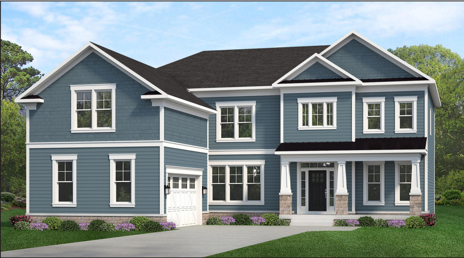
PICTURED: ELEVATION K WITH OPTIONS APPROXIMATELY 4,526 SF - 6,603 SF 4 - 6 BD, 4.5 - 6.5 BA