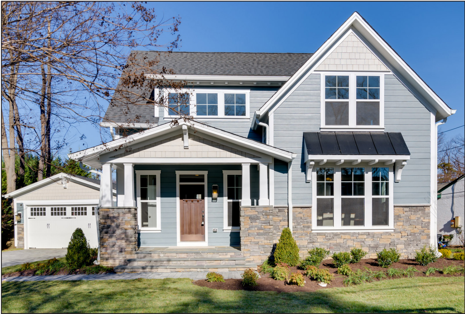
PICTURED: ELEVATION A WITH OPTIONS

APPROXIMATELY 2,396 SF STANDARD WITH 3 BD, 2.5 BA