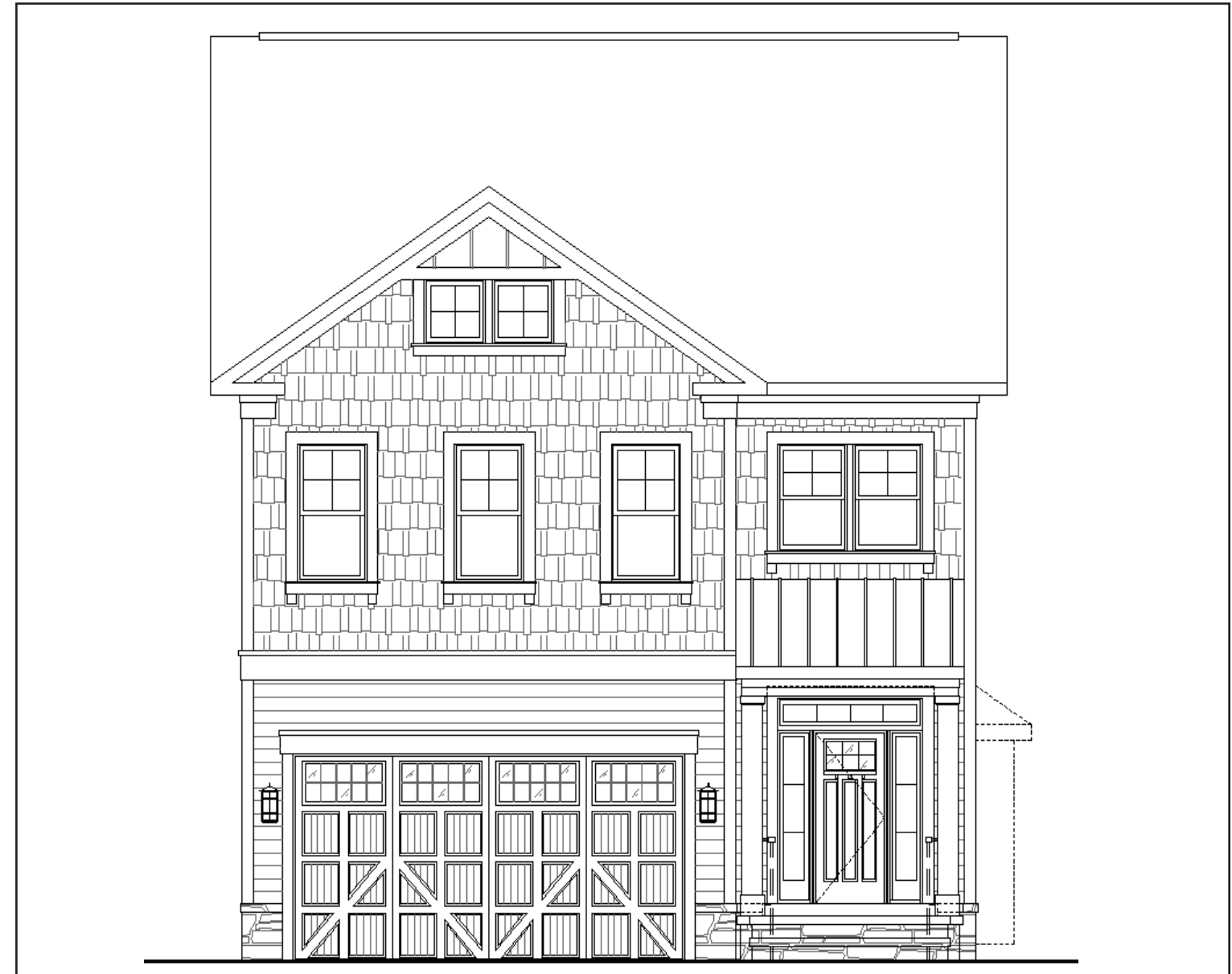
PICTURED: ELEVATION K WITH OPTIONS

APPROXIMATELY 4,318 SF STANDARD WITH 5 BD, 4.5 BA