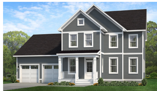
ELEVATION A (shown on cover)